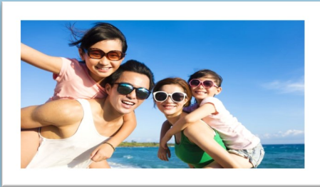
TAKE THE FAMILY ON VACATION?