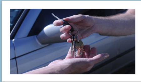
Get APPROVED for a NEW CAR?